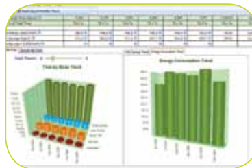
Track trends in energy consumption over time

* Formulas obtained from US Environmental Protection Agency - US Department of Energy