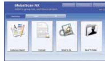
GlobalScan NX Project based scanning meets the needs of different business documents