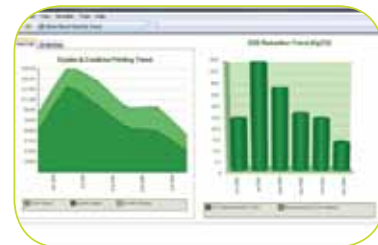
Translate usage data into reports that detail CO 2 reduction trends